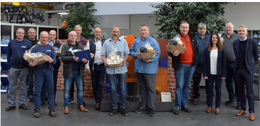
Photo 2: These employees have been loyal to CLOOS for 40 and 50 years.